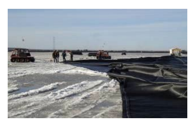
Figure 9. Deployment of a fabricated panel on the ice.

Installation began with the preparation of road tie-ins at the edge of the pond. These anchors used the 175 by 175 kN/m fabric so that cross seams and diagonal seams could be prepared. Most of these anchors had triangular sections so that the road would start out