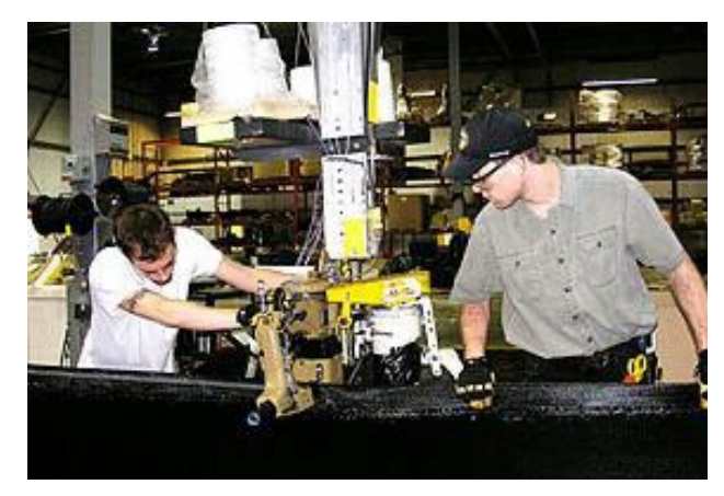
Figure 5. Shop Fabrication Sewing.

The new proposal for Pond 5 high strength woven geotextile road fabrics included 23 road crossings using the 175 by 175 kN/m fabric and the balance of the 13 kilometers of road with the newly developed 105 by 155 kN/m fabric. This change in fabric meant that the project seaming requirement of 82.5 kN/m could be met in both directions while reducing the cost and the weight of materials substantially. This change saved $3,263,000 in direct material costs and a further $130,000 in fabrication fees. It also