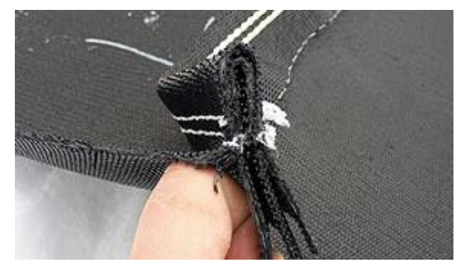
Figure 7. J-Seam Stitch Type.

The new 105 by 155 kN/m material did not do as well. The sewing of high strength woven geotextiles varies according to the construction of the geotextile. Since the 105 by 155 kN/m fabric was a new material with a new construction sewing would have to be developed from scratch. Initial seams were prepared using standard sewing practice. These initial seams produced 67.2 kN/m with a J-Seam, 69.4 kN/m with a butterfly seam, and 64.0 kN/m with a prayer seam (a flat seam with no folds). Obviously more work was needed to get reliable seams in this unique new material.