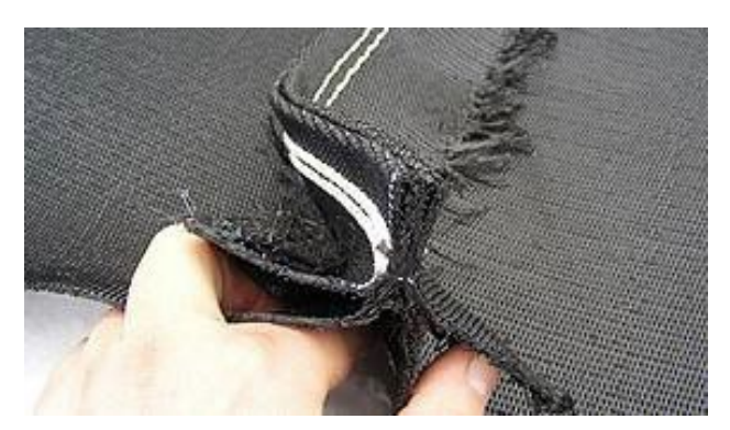
Figure 8. Butterfly Stitch Type.

Working closely with the fabric manufacturer there were four aspects of the sewing that were reviewed. The first aspect was the thread. The thread used was a custom thread designed for high strength geotextile sewing of soil containers. This thread is one of the strongest available and was meeting seam strengths on the 175 by 175 kN/m fabric. The thread appeared to be suitable. The second aspect was the seam type. There are two widely used seam types in high strength geotextiles; the J-seam (Figure 7) and the Butterfly seam (Figure 8). Both seams put four layers of fabric in the seam area and will generally produce a similar strength. The Butterfly seam has the advantage that all layers of material are easily seen while in the J-seam the bottom layer is hidden. The J-seam is easier to sew, and initial development was focused on this seam type.