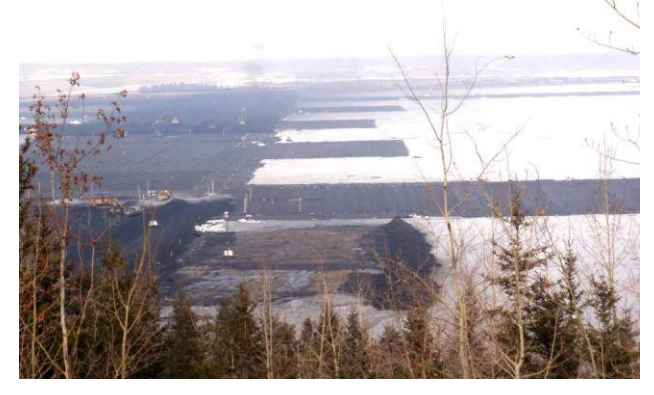
Figure 12. Extent of roads at the end of construction in winter of 2010.

There were several important things learned on this project. The first and most important was that placement and sewing of high strength woven geotextile could take place safely on the ice of a frozen tailings pond. The placement and sewing were difficult in poor weather but, with the use of heated sewing trailers, produced seams that met the project specifications fully. The second was that the deployment and seaming of the geotextile was not the bottleneck that was originally anticipated. Large, prefabricated panels (100 by 22.5m) moved most of the seaming off the ice and into the fabrication shop which reduced the field seaming to a minimum.