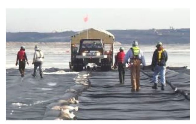
Figure 1. Preparing to sew a seam on the ice. Note the stockpile of coke in the background.

For up-to-date technical information, be sure to visit us online at www.LayfieldGeo.com