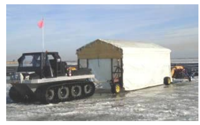
Figure 6. Completed Sewing Trailer.

The last problem with field sewing this geotextile was how to test the seams produced. Wide width geotextile seam testing equipment is not widely available (ASTM D4884-96, 2003). Seam test coupons from the site would have to be sent to a lab in either Quebec or Texas for testing. Ft McMurray does not have overnight courier service to these labs. If samples were sent out, then it would have taken about three days to receive results. At the proposed installation rate of 15,000 m2 per day this would result in 45,000 m2 of material exposed on the pond that couldn't be backfilled until test results were received. There was a concern that this might hold up coke placement.