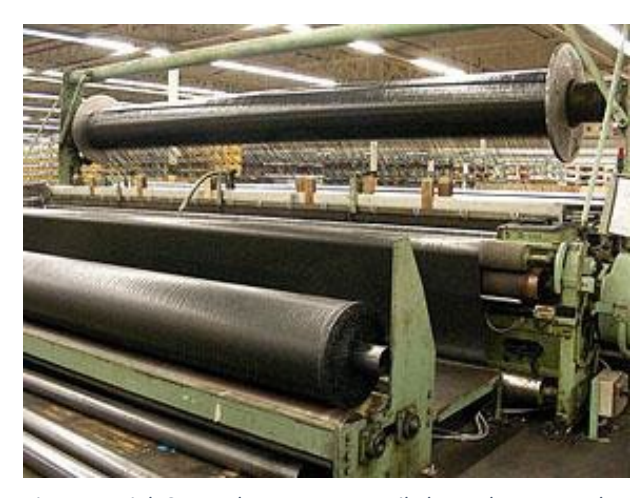
Figure 4. High Strength woven geotextile loom that can make geotextiles with stacked tapes.

A custom fabric design for this project was discussed. The two main specification requirements were strength and a specific opening size (to retain tailings but promote drainage). The starting point was an existing